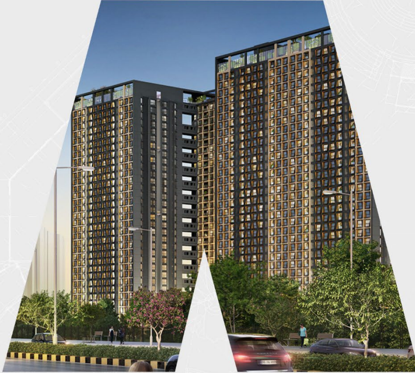
A PURAVANKARA HOME AT PURVA ATMOSPHERE